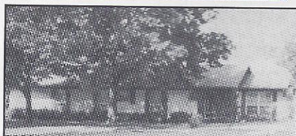
101 DRIFTWOOD CIRCLE $119,900 HAVE IT ALL! Well maintained 3/2/2 brick on beautifully landscaped lot w/inground pool & charming gazebo. Sunken Living RM features WBFP Formal DR is perfect for entertaining. SHARYN & LARRY PANKEY 972/380-7906 #19512