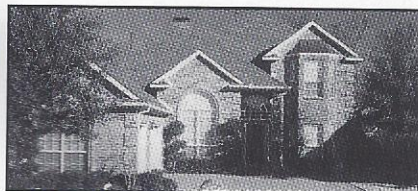
2712 NORTHVIEW $254,900 THE BEST IN GOLF COURSE LIVING! 4/3/3/3 Las on 8th Tee. Features: Plantation Shutters, Custom window treatments, Hardwood floors, Corian countertops. Make this carefree home yours & spend your time on your golf game! KAY CARLSON 972/333-4174 #18822