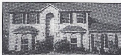
2321 SHERBROOKE LANE $254,900 BEAUTIFUL CENTEX GETTYSBURG II PLAN. 4/2.5/2/3LA has loads of upgrades! Triple upgraded carpet. See this one soon! HOLLY MILSTEAD 972/381-6630 #18492