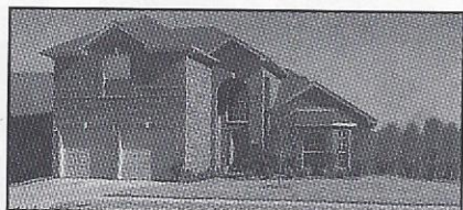
5105 LAKE BEND DRIVE $189,900 EXCEPTIONAL 4/2.5/2/LA W/SPARKLING POOL & SPA. 48" White kitchen cabinets, Tile flooring, 2 BR up/2 BR down. Oversized backyard has expanded aggregate & rock pool decking. LENA MILSTEAD 972/381-6620 #19562