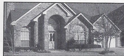
1405 RANCHO VISTA DRIVE $209,500 PANORAMIC VIEW OF GOLF COURSE FROM BREAKFAST, FAMILY & MASTER BR. Zero lot line 3/2/2/LA has 2 FP's. Kitchen Pantry. Beautiful décor. LENA MILSTEAD 972/381-6620 #18672